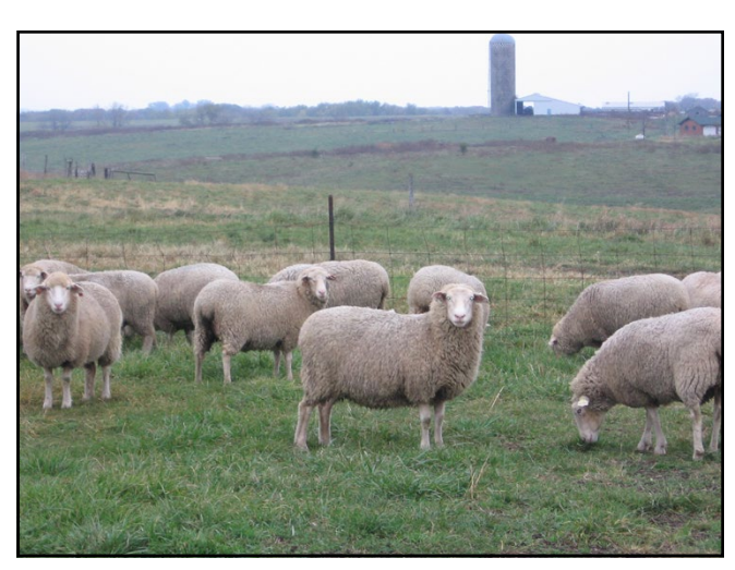
crossbred ewes in the Midwest appear in good body condition at the end of breeding season.