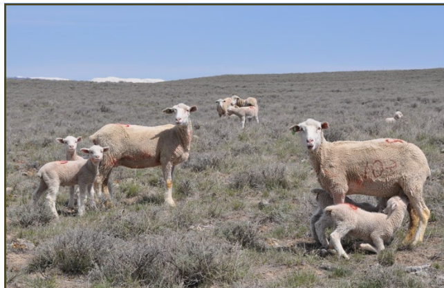
Even though the correct ram is very important, producers should not forget about the ewes in their flock.